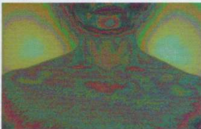
Above: The three PIP scans show the progression from an untreated throat chakra, (notice the abundance of red, corresponding to the patient's complaint of a sore throat), to a definite improvement throughout the aura after just a few minutes of treatment.